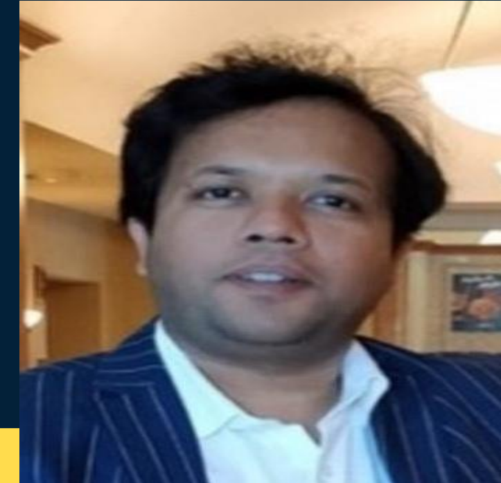
MBA- NRI Market & Client Specialist

He has over 15+ years of experience in promoting Real Estate Market of India in overseas. He has strong connections and network with Indian diaspora in many countries. He is actively helping and assisting Indian diaspora in buying, selling and managing their properties in India. He is managing many Investor Meets and organize such property show events across the Globe.