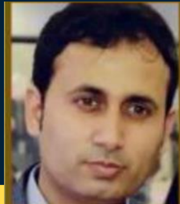
Cost Accountant, MBA

He has vast experience over 20+ years in doing various Company Profiling, Market Research and Market Intelligence in Real Estate Sector. Direct & Indirect Taxation, Fund raising, Documentations- review & validation.