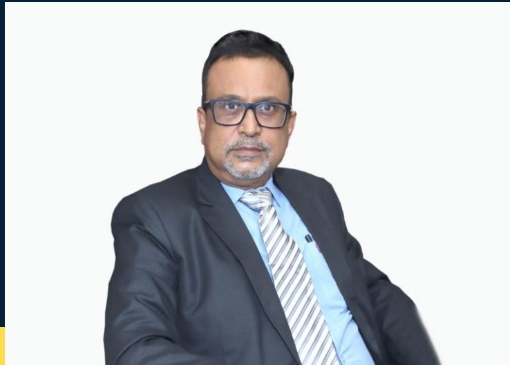
Civil Engineer & MBA

He has over 30+ years of experience in Infrastructure & Real Estate companies like L&T, Tata, Jacobs Engineering-USA & Maccaferri-Italy in very senior positions. He has vast experience in leading the Business Development, Project Execution, Legal & Contract, Claims & Risk Management for EPC & Service Management Contracts, Strategic Alliances, Technology Up-gradation, Capacity Building, Process Implementation & Real Estate Sales.