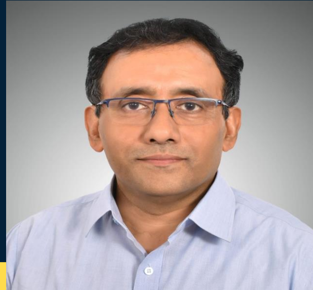
Ex Head of Global Commercial & Merchant Data Sciences American Express Bank India.

He has been a part of the BFSI sector for the last 25+ years. He holds a Doctorate degree in the field of Financial Economics and a Master's in Quantity Economics.