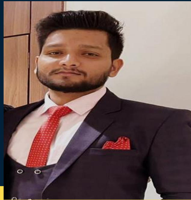
LLB- Practicing Lawyer

He is having vast experience over 10+ years in Civil cases dealing mainly to all types of property related matters, vetting, validating & legal advising on property agreement & documentations, approvals, clearances, licenses etc related to Builder / Developers particular Projects.